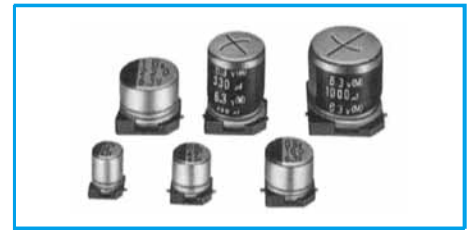
Marking color : Black print ( \phi 4 \times 5.3L - \phi 8 \times 6.5L, \phi 12.5 \times 13.5L ) : White print on a brown sleeve ( \phi 8 \times 10L - \phi 10 \times 10.5L )